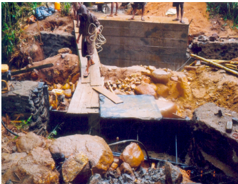
Prior to the Development of the Lorawatta Bridge belongs to the Panwilathenna Grama Niladari Division in the Doluwa Division of the Kandy