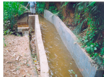
The completion of the Development of the Rajaela belongs to the Godawela Grama Niladari Division in the Doluwa Division of the Kandy