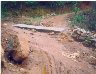
prior to the development commenced at the Morahena Minuwanwewa Road belongs to the Masgolla Grama Niladari Division of the Doluwa Division of the Kandy District.