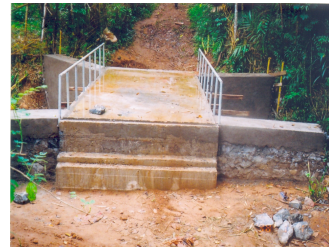
The completion of the Development of the Lorawatta Bridge belongs to the Panwilathenna Grama Niladari Division in the Doluwa Division of the Kandy