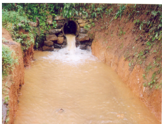
Prior to the Development of the Rajaela belongs to the Godawela Grama Niladari Division in the Doluwa Division of the Kandy