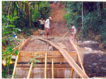
Ongoing Development of the Lorawatta Bridge belongs to the Panwilathenna Grama Niladari Division in the Doluwa Division of the Kandy