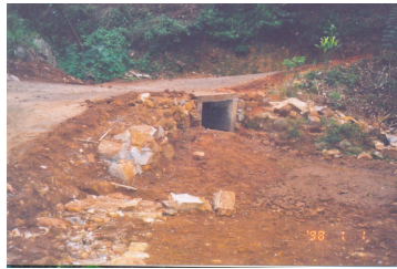
Ongoing Development works at the Morahena Minuwanwewa Road belongs to the Masgolla Grama Niladari Division of the Doluwa Division of the Kandy District