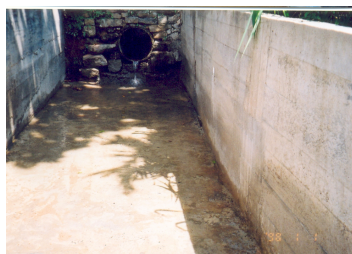
Ongoing Development of the Rajaela belongs to the Godawela Grama Niladari Division in the Doluwa Division of the Kandy