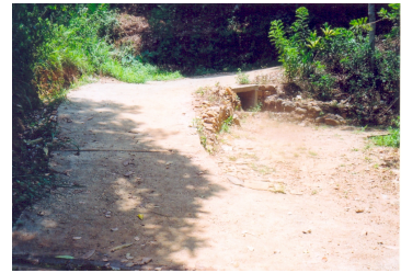
The completion of the Development works at the Morahena Minuwanwewa Road belongs to the Masgolla Grama Niladari Division of the Doluwa Division of the Kandy District