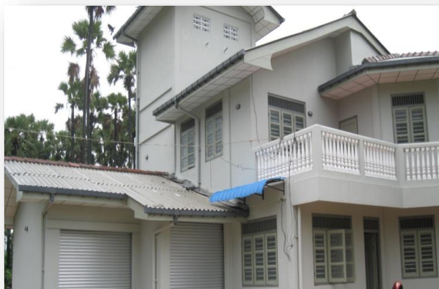
Veterinary Surgeon Office and Quarters at Karainagar