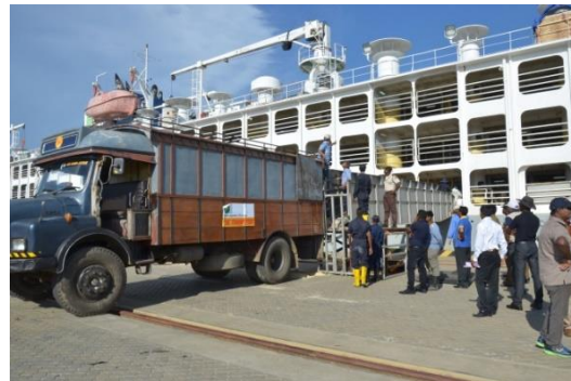
Landing dairy cows from Hambantota Port to transport to Ridiyagama farm