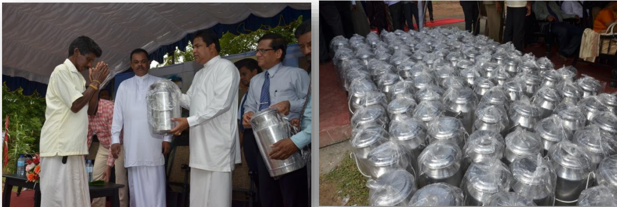
Distributing milk cans to the milk farmers by Hon. Minister of Rural Economic Affairs

This programme is being implemented through the Milco (Pvt) Limited under financial provisions from the Livestock Development Division of the Ministry. Milk cans with a capacity of 10 litres have been distributed among 975 farmers and Rs.3.1 mn. has been invested in this scheme.