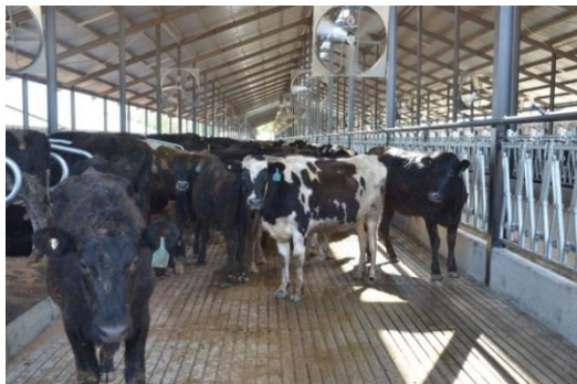
New cattle shed with controlled environmental conditions in the Ridiyagama farm (NLDB)

The daily milk production capacity of imported milk cows is between 23,000 – 25,000 litres, and the normal production of a mother milk cow has been increased up to 19 litres per day. This is the highest milk production rate so far reported to the National Livestock Development Board, and the sale price of one litre is Rs.85.00. By end of September 2015, 804 heifers and 2,763 male calves of high breed including 455 heifers and 508 male calves born of the imported milk cows were issued to farmers by the Livestock farms belonging to the National Livestock Development Board. In addition, 365 female animals are being reared in livestock farms at Bopathtalawa, Manic Palama and Dayagama for the benefit of the next generation.