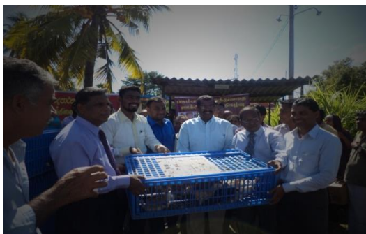
Distributing Day old Chicks in the Northern

It is expected to increase the production of chicken and eggs so that every individual could consume at least 03 eggs per week, and 10 kg of chicken per year. Meanwhile, arrangements have been made to establish 2,788 small scale farms by the third quarter of 2015. In addition, arrangements are being made to establish 18 small-scale animal feed plants, 18 meat processing centres and 04 incubators.