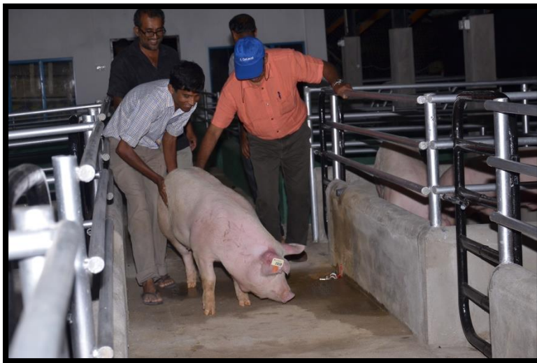
Providing imported animals to the modernized Swine Breeding Farm at Horakale belong to NLDB

Establishment of a pig herd in the Horakele farm belonging to the National Livestock Development Board, import of male and female pigs for distribution, expansion of artificial insemination activities at the livestock training centre of Kotadeniyawa in the Western Province are the measures taken to develop local swine industry. In addition, it is expected to upgrade 90 swine farms presently existing mainly in Western and North-Western provinces into environmental friendly ventures under this programme. Development activities are now in progress in the model swine farms established at the Kotadeniyawa Farm in addition to the construction of modern sheds for swine industry in Horakele swine farm of the National Livestock Development Board.