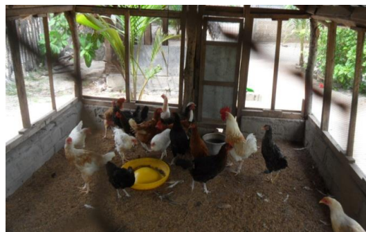
Small scale developed poultry farm