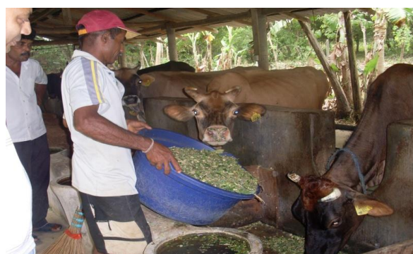
Improved cattle sheds and hybrid dairy cows under the Establishment of Breeder Farms