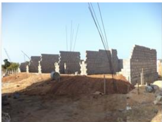
Male Hostel being constructed at the Kilinochchi Animal husbandry training school