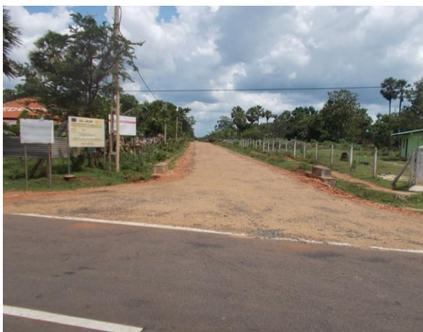
Renovation of internal Road at Mathiyamadu