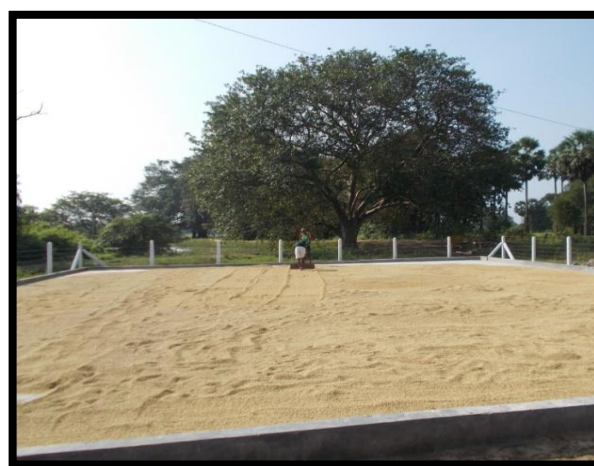
Paddy Drying Floor Mannakulam