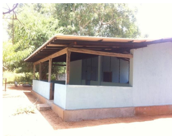
Renovation of Pre-School at Agbopura