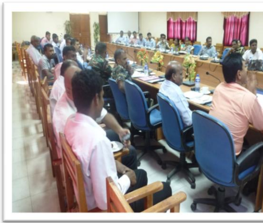
Photo gallery of the activities by the Disaster Management Unit