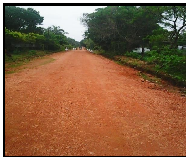
Formation and Gravelling at Mahamailankulam