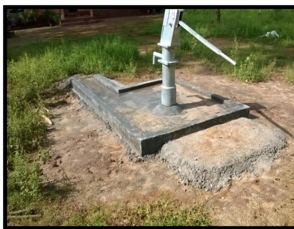
Const. of Tube Well at Paranthan