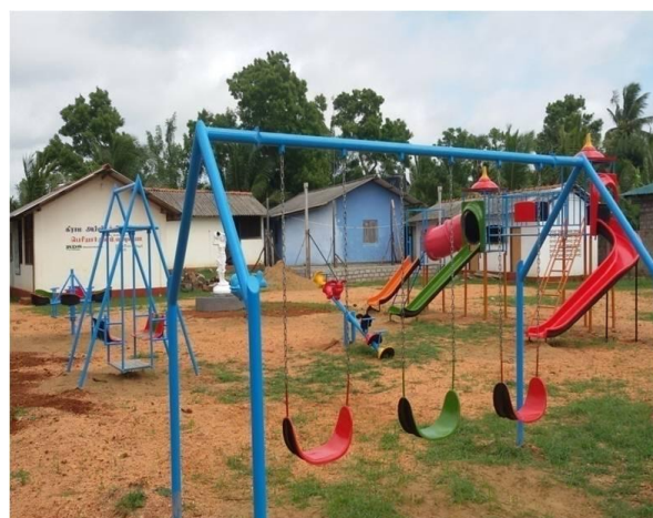
Construction of Children Park at Periyarkulam