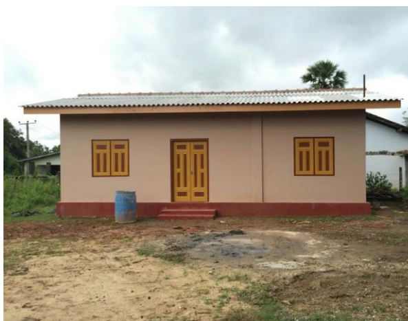
Construction of Community Hall at Valavaithakulam