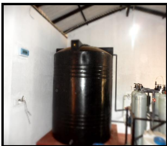
Providing Water purification Machine