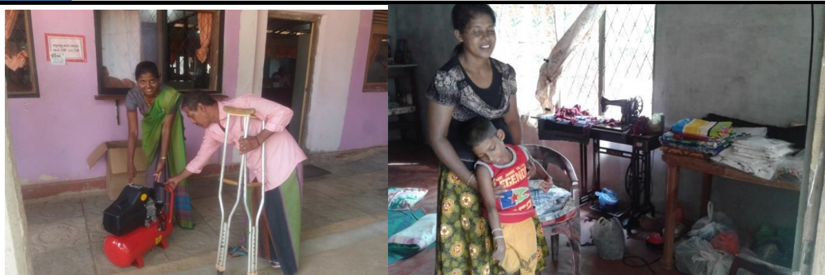
Self-Employment Assistance to Disablers under the Dr. Ananda Ranasinghe Foundation.