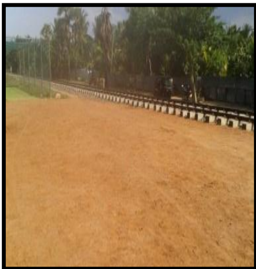
Reconstruction of Play Ground Koolavady, Manmunai North