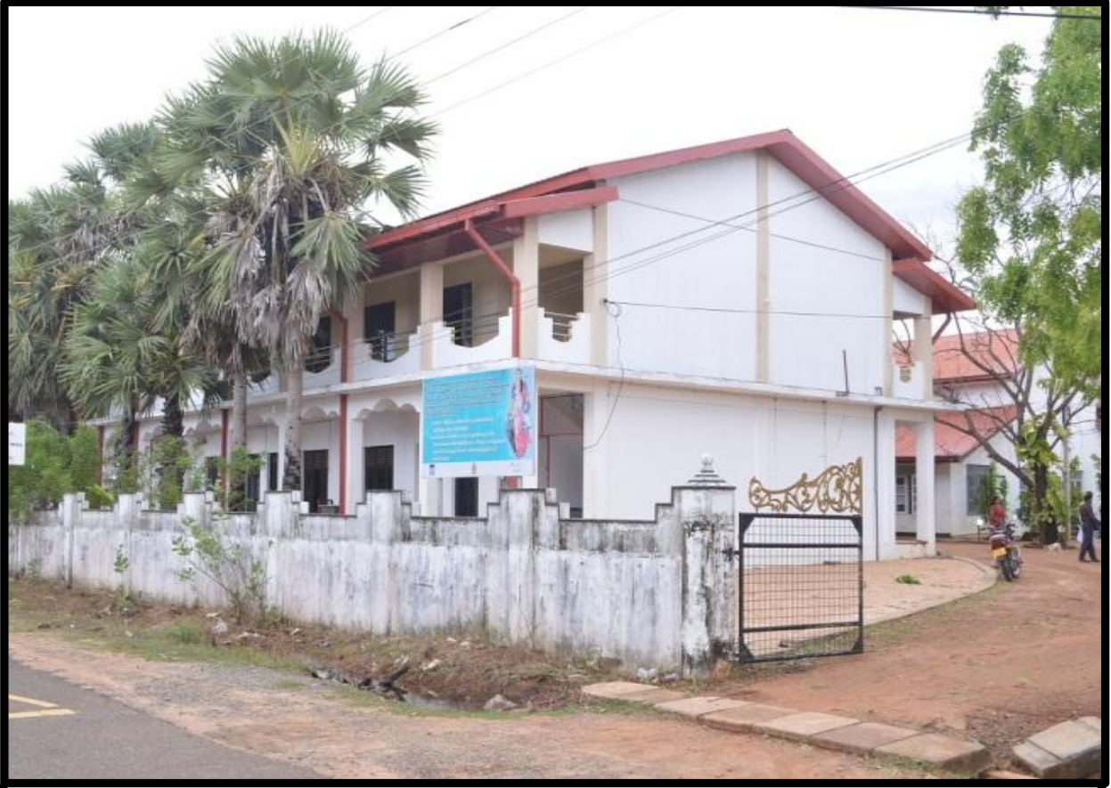
මන්නාරම බටහිර ප්‍රාදේශීය ලේකම් කාර්යාලය ගොඩනැගිල්ල නිර්මාණය. மண்ணமுனைமேற்கு பிரதேச செயலக கட்டிடம் நிர்மாணிப்பு Construction of Divisional Secretariat Building, Manmunai West