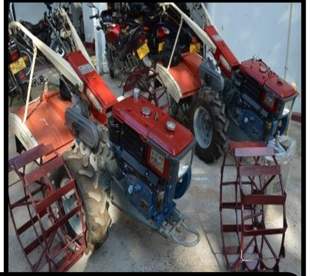
කෘෂිකර්ම අමාත්‍යාංශයේ තරුණ ගොවීන්ට ට්‍රැක්ටර් රථ ලබා දීමේ උත්සවය விவசாய கமத்தொழில் அமைச்சினால் இளைஞர் விவசாயப் பண்ணையாளர்களுக்கு உழவுஇயந்திரங்கள் வழங்கிவைக்கும் நிகழ்வு. Supply of tractors to Agriculture farmers by Minsitry of Agriculture & Agrarian Services