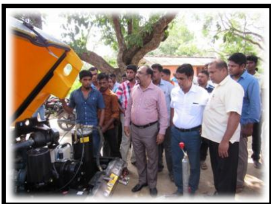
Building of Vinayakar Basalt Labuorer's Society; Ammankulam; Porativupattu