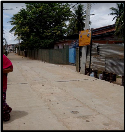
Construction of Concrete Road with Drainage at Yasim Bawa Street, Mvadichenai, Koralaipattu Central