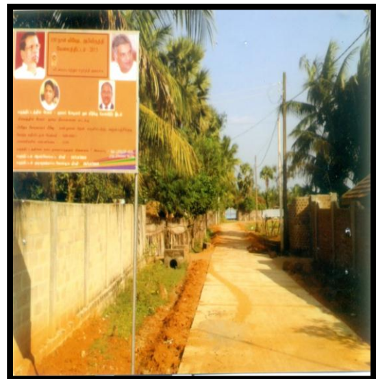
Construction of Concrete Road Kumarappodiyarkula Street, Thuraineelavanai, Kaluwanchikudy