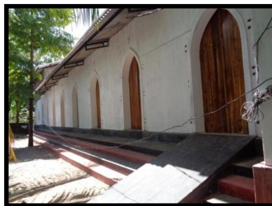
Reconstruction of Church, Navatkudah Soutn Manmunai North