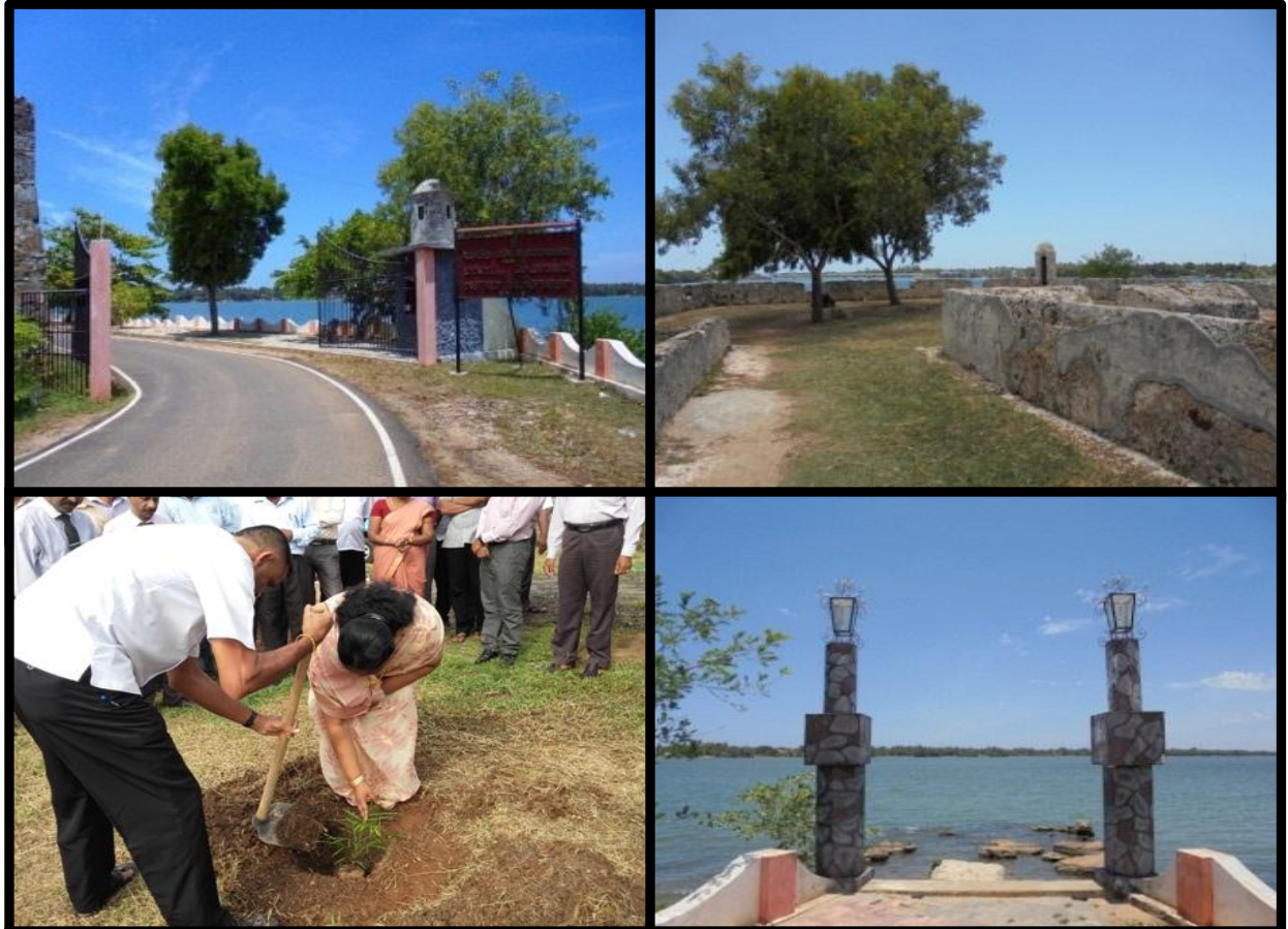
කච්චේරි කොටුව අලංකරණ கச்சேரி கோட்டை அழகுபடுத்தல் Kachcheri Fort Beautification