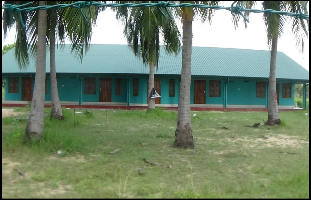
ස්වදේශ කටයුතු අමාත්‍යාංශයේ කෝරළේ පත්තු උතුර ප්‍රාදේශීයේ සංචාරක නිල නිවාස ඉදිකිරීම. உள்ளாட்டලුවලින් අමාත්‍යාංශයේ කොරළාපත්තු වැට්ටු පිරිසේ සතුලා විලුති තිර්මාණිප්පු Construction of Circuit Banglow at Koralaipattu North Division by Ministry of Home Affairs