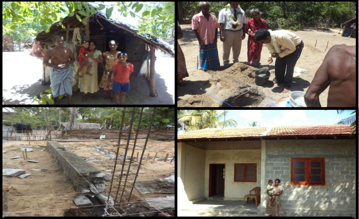
ආපදා කළමනාකරණ අමාත්‍යාංශයේ නිවාස වැඩසටහන அனர்த்த முகாமைத்துவ அமைச்சினுடான வீட்டுத்திட்டம் முன்னெடுப்பு. Housing Scheme for Disaster affected Peoples by Ministry of Disaster Management.