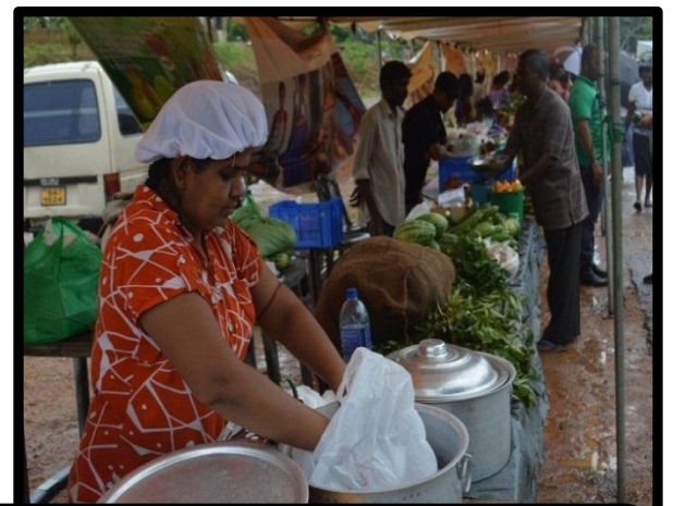
ස්භාවික පොහොර භාවිතා කරන ඵලවත් නිෂ්පාදනය උනන්දු කර වීමේ වැඩ සටහන இயற்கை முறையில் சேதனப்பசளை பயன்படுத்தி மரக்கறிகளை உருவாக்கும் முறைகளை ஊக்குவிக்கும் நிகழ்வு முன்னெடுப்பு Innagural of Encouraging on Natural Agriculture Farming