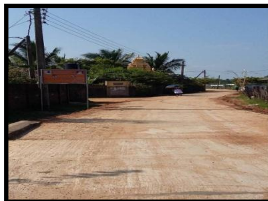
Construction of Concrete Road,; Mathupuram Road, Manmunai pattu