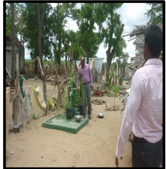
Construction of Tube Well, Kinnayadi, Koralaipattu