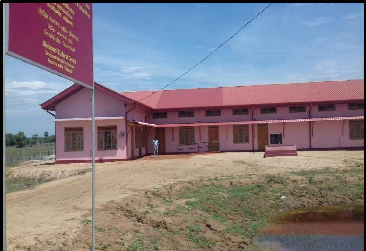
සංකෘතික අමාත්‍යාංශයේ පෝරතීව පත්තු ප්‍රාදේශීයේ සංස්කෘතික ශාලාවේ ඉදිකිරීම. කලාසාර අමාත්‍යාංශයේ, පොරතීවැට්ටු පිරිසේ සෙයලක කලාසාර තිලයයම් තිර්මාණිප්පු Construction of Cultural Hall at Porativupattu Division by the Ministry of Cultural Affairs