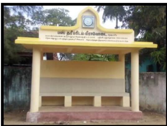
Construction of Bus Hold, School Road, Meeravodai East Koralai pattu West