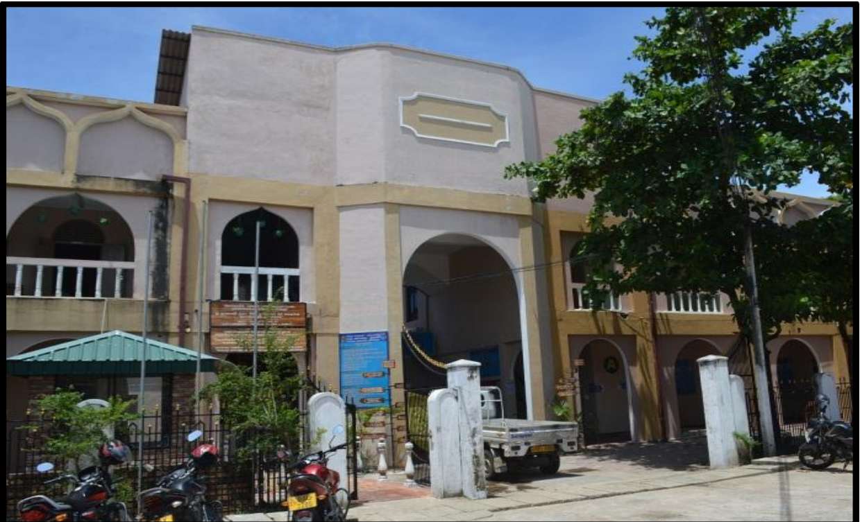
කාන්තාන්කුඩ් ප්‍රාදේශීය ලේකම් කාර්යාලයේදී ගොඩනැගිල්ලේ කොටසක් නිර්මාණය. காத்தான்குடி பிரதேச செயலக பகுதிக் கட்டிடம் நிர்மாணிப்பு Construction of Part of Divisional Secretariat Building, Kattankudy