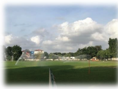
Cricket ground of D.S. Senanayake College, Colombo 07.