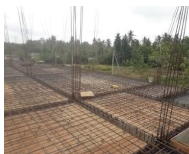
Provincial Sports Complex, Bingiriya