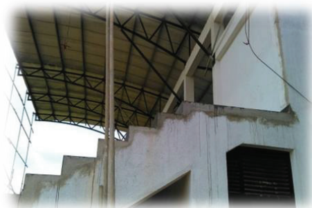
Pavillion of Narammala Mayurapada Vidyalaya

Accordingly, construction work on rural playgrounds, school playgrounds and 53 swimming pools in districts such as Kurunegala, Colombo, Kegalle, Matale, Kandy, Ampara, Monaragala, Gampaha, Mannar, Nuwaraeliya, Kalurata, Rathnapura and Galle is underway.