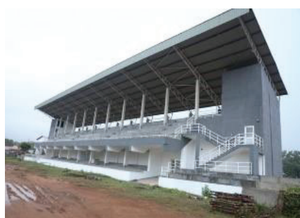
Provincial Sports Complex, Kilinocchi