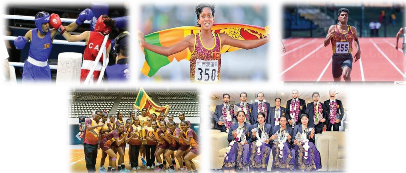
Athletes who gained achievements in International Level Competitions.....