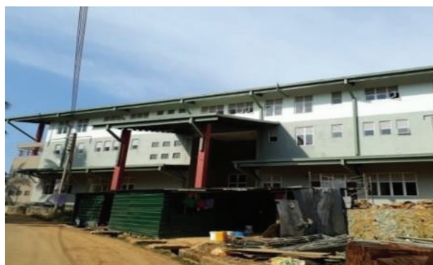
District Sports Complex, Puttalam