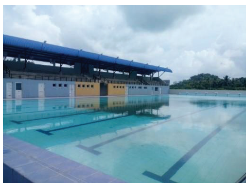
Sabaragamuwa Provincial Sports Complex, Rathnapura