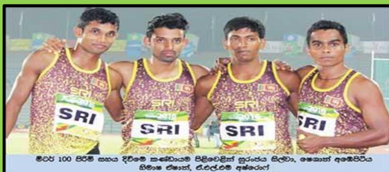
South Asian Games XII