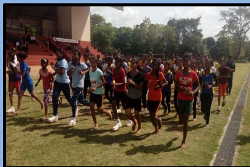
Special events in Kreedha shakthi programme