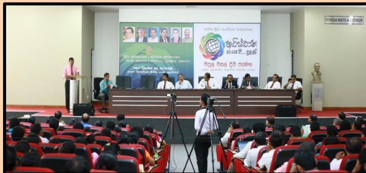
Special events of Talent Identification Programme

To deliver sports items to 315 training centres and to train selected students in training centers due to commence in 2017.