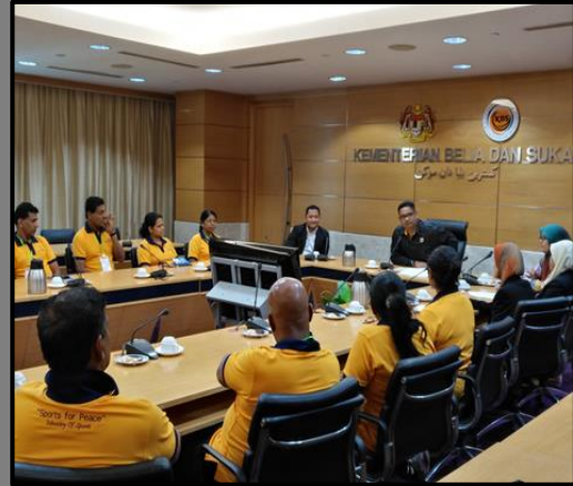
Event in a foreign training course for officers of the sports field