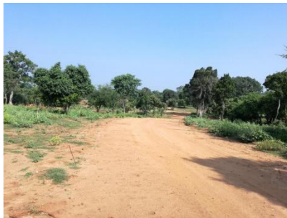
Road network (gravel)