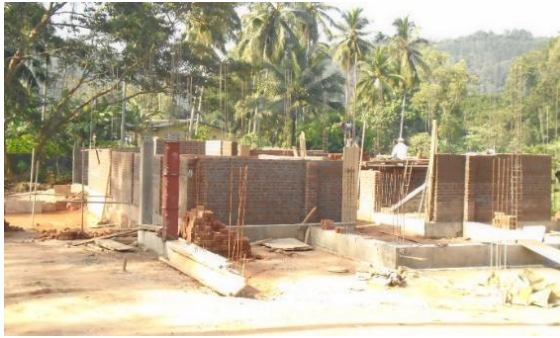
Veterinary facility building