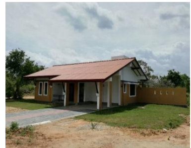
Quarters for the Staff Officers