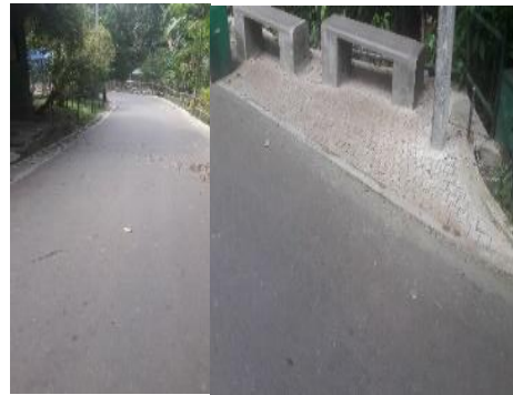
Renovation of the route no. 08 and adjacent areas