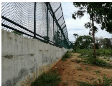
Chain-link Fence with height 16 feet