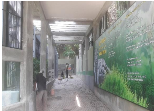
Jaguar and white tiger enclosure - phase – II