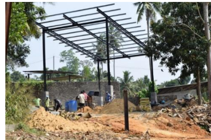
Construction of elephant