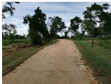
Safari road network (gravel)