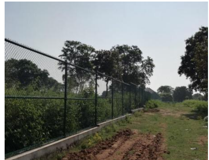
Fence with height of 8' and 16' feet