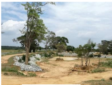
Tank - 02