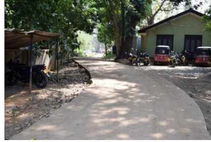
Renovation of service roads