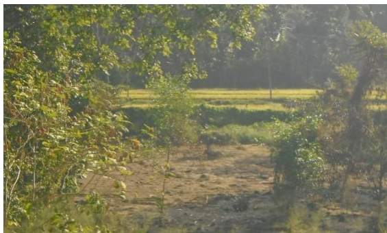
Area for free living aquatic birds- stage I