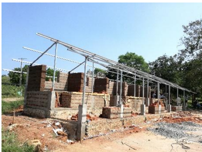
Construction of sales outlets