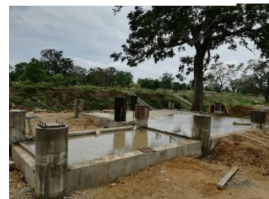
පිරිමි අලි සඳහා den - 01