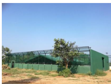
Animal holding area