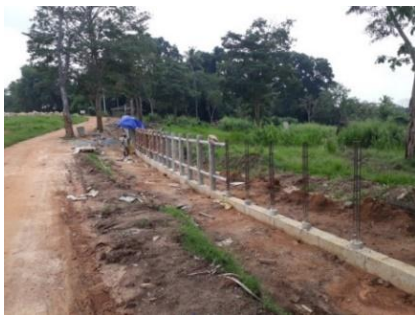
Night opening activities - Fence