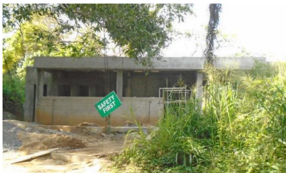
Toilet complex for visitors