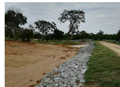
Tank - 03