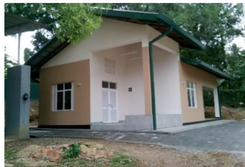
Animal feed processing unit