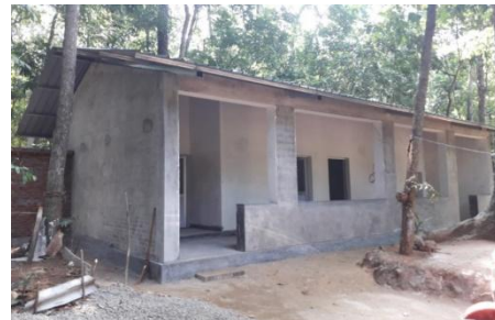
Narambedda rest room