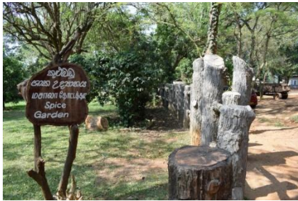
Development of the park VI