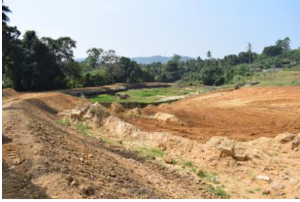
Expansion of the existing tank