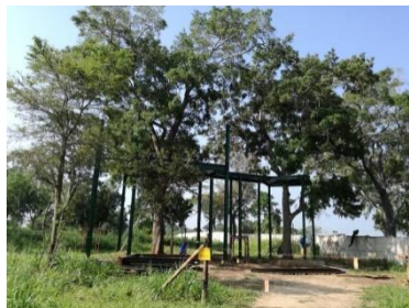
Tree huts 01