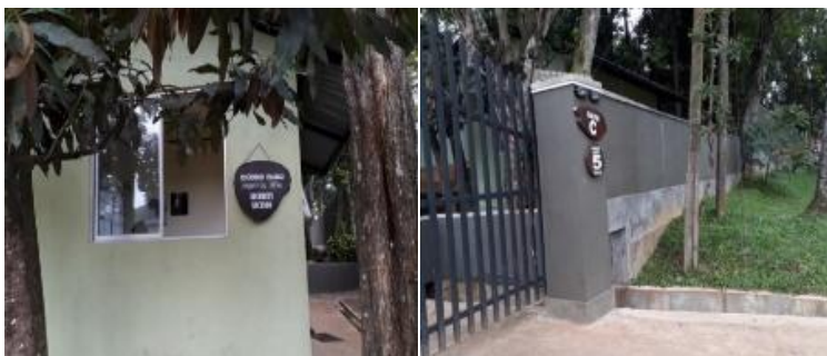
Boundary wall and the security hut