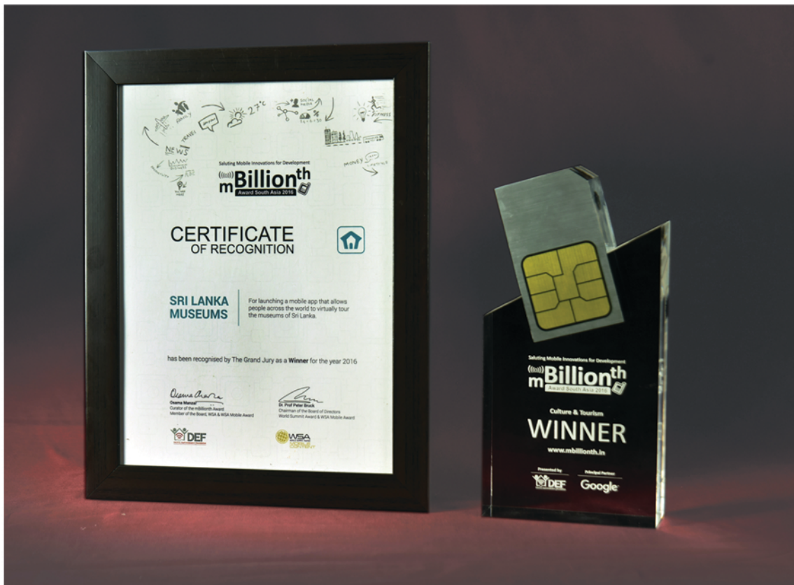
Award of m Billion th - 2016 in South Asian Awards Ceremony