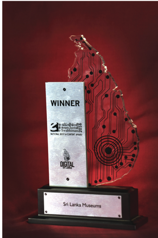
Swabhimani 2016 – Received the award at the “Best e – group”