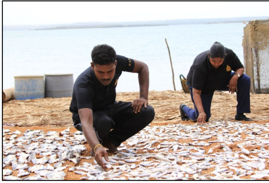
Bricks Manufacturing Projects