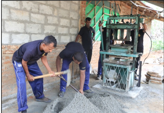
Ekel broom Manufacturing Projects