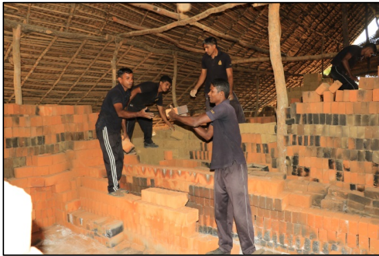
Block Bricks Manufacturing Projects