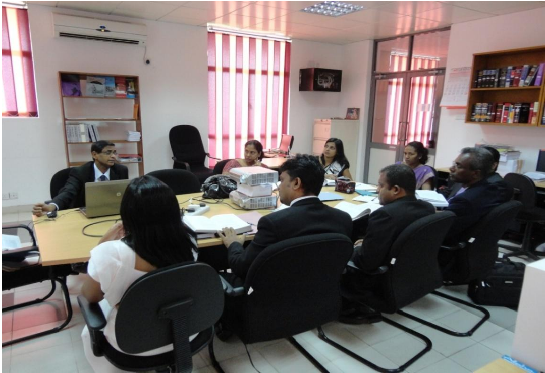
Training sessions for Trainee Judges