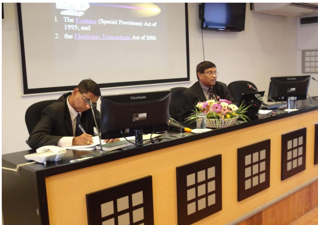
Training Sessions for In – Service Judges