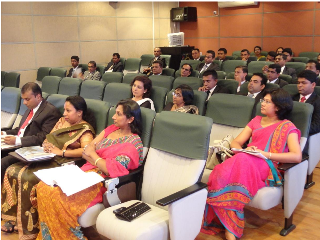
Training Sessions for In – Service Judges