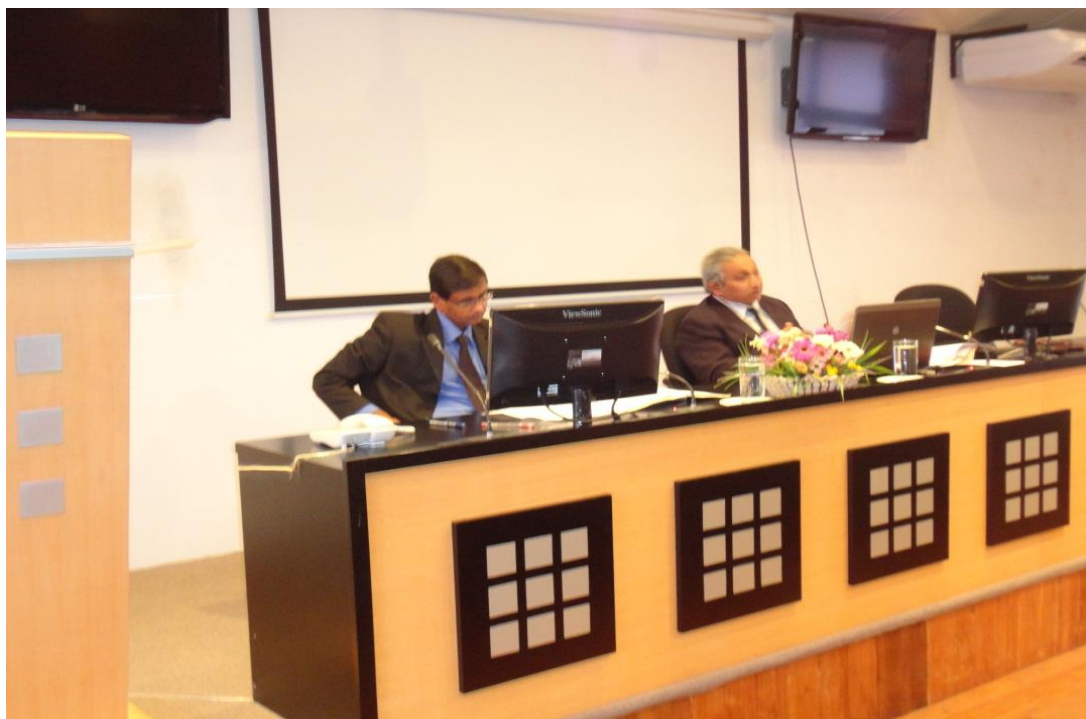
Training Sessions for In – Service Presidents of Labour Tribunals