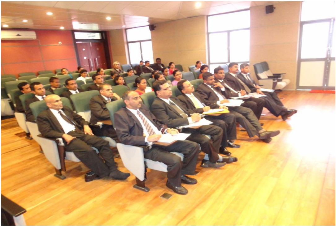
Training Sessions for In – Service Presidents of Labour Tribunals