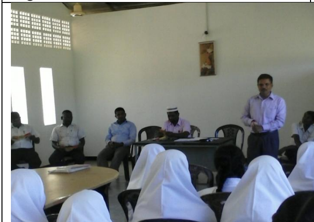
Awareness programme for the School Children