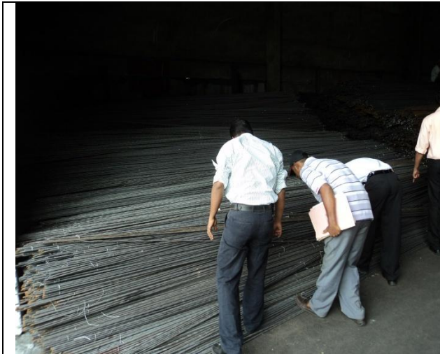
Conducting a raid on steel bars