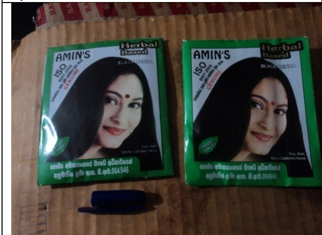
Two samples of original and counterfeit hair dye