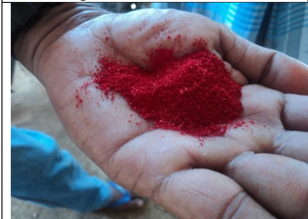
Adulteration of Chili Powder with a textile dye