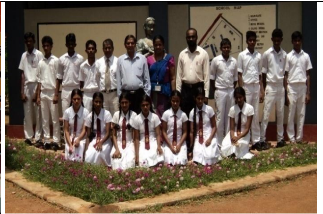
Deyata Kirula National Development Exhibition at Anuradhapura, Oyamaduwa