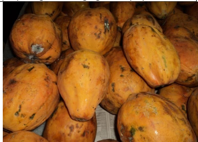
Carbide applied fruits