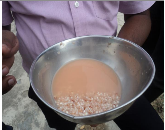
White rice is adulterated with a dye