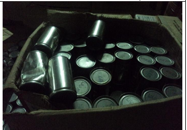
Sample of expired canned fish while preparing for changing the expiry date