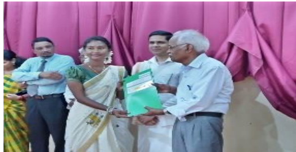
The second management board meeting of Tower Tamil Drama and Performing Arts School was held on 04.05.2022 at the Chief Secretariat of Northern Province.