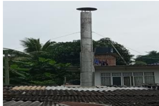
Molagoda - Kegalle