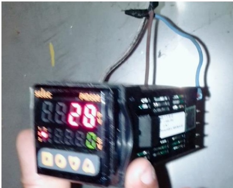
Kovulara - Monaragala