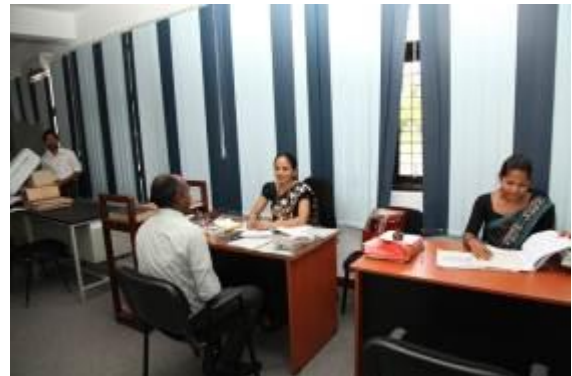
Public Relations Office