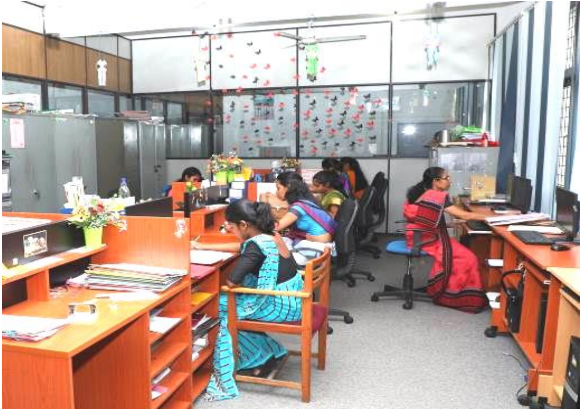
Administration Division of the Department