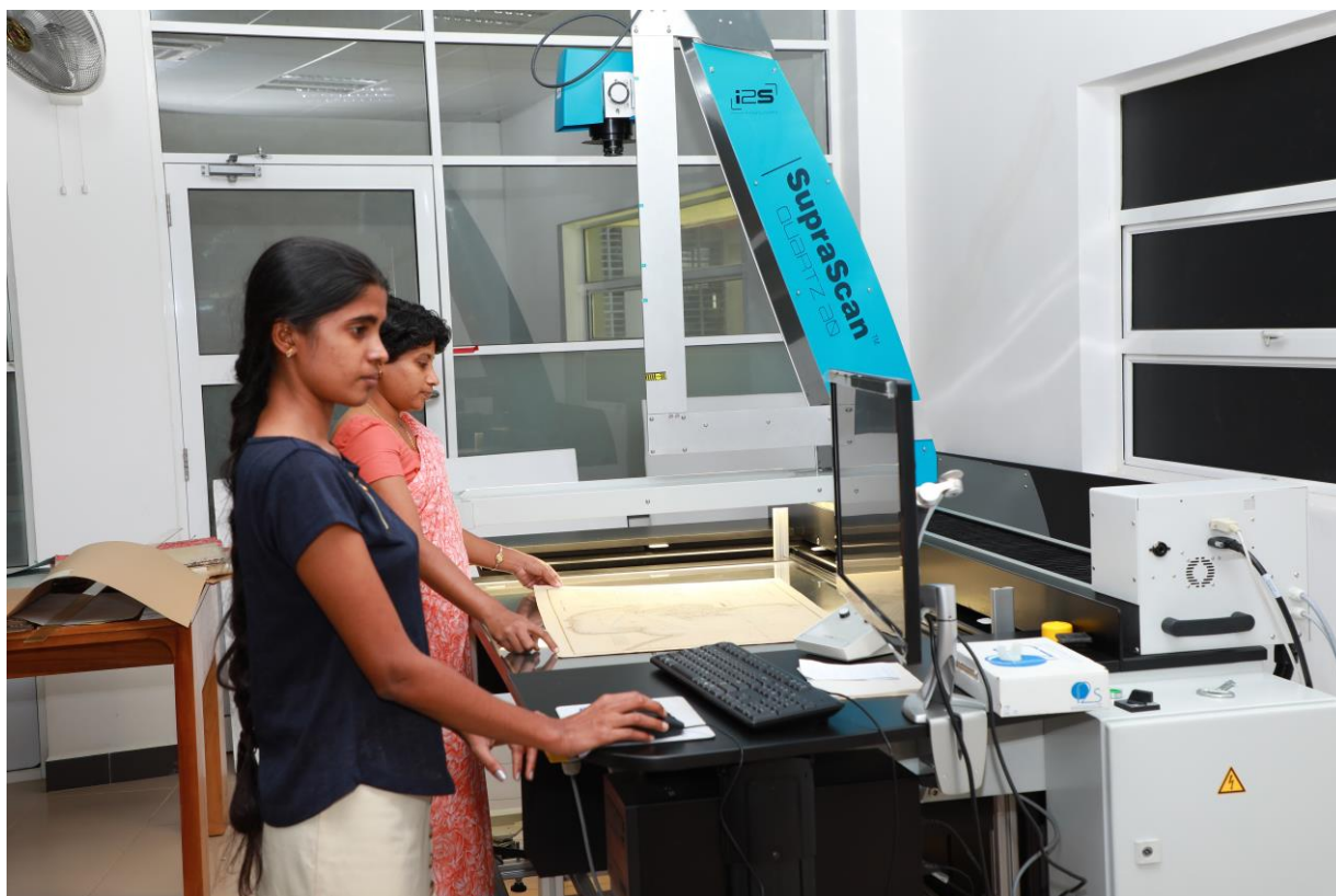
i2s super scanner machine

Furthermore, 3080 maps were accrued from the Survey Department and were listed, computerised and deposited in map cabinets.