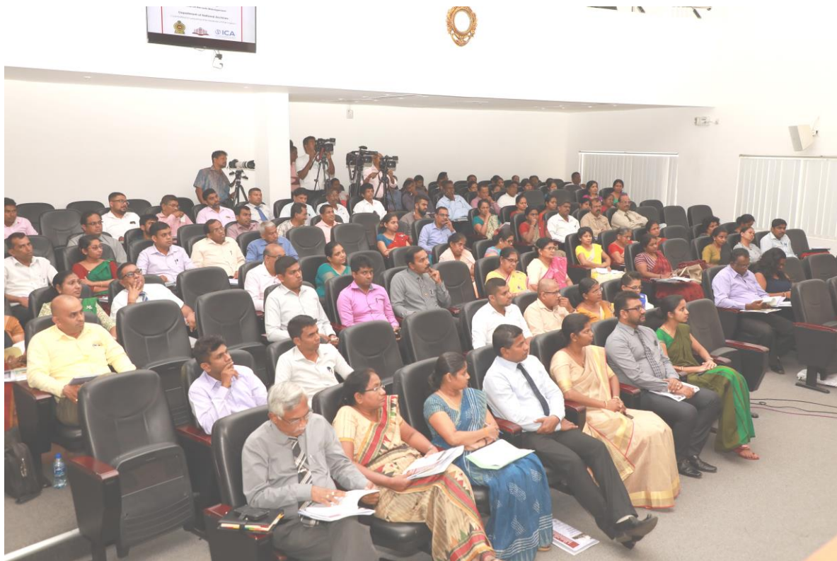
Conference and Inauguration Ceremony

It is thus opportune to discuss the management of traditional records as well as digital records in local authorities and the participation of two international experts on municipal archives was a great benefit for this programme. Topics in relation to the subject matter of records management such as records appraisal, destruction of unwanted records, accrual of records at the Department of National Archives for permanent preservation under certain rules and regulations and access of information by the public in municipal archives were discussed. In 2016, the National Archives carried out a survey on records and record rooms of local government institutions in Sri Lanka through a questionnaire to gather data with regard to the management of municipal records in cooperation with the Ministry of Provincial Councils and Local Government was the basis for this.