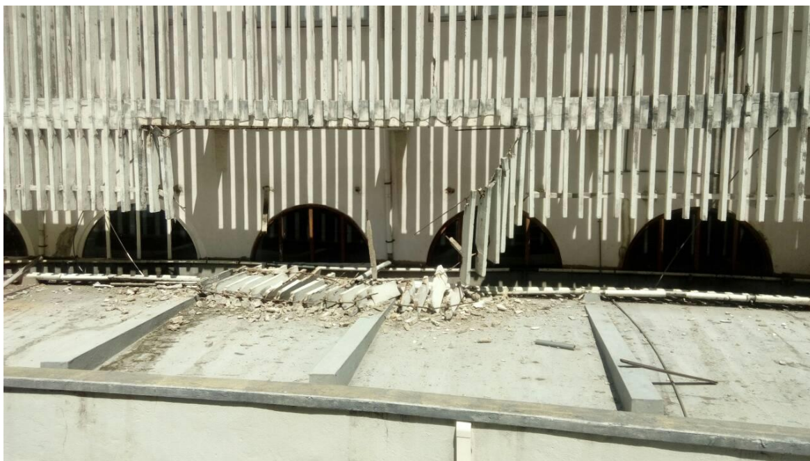
Concrete fins on the main building collapsing in April 2018