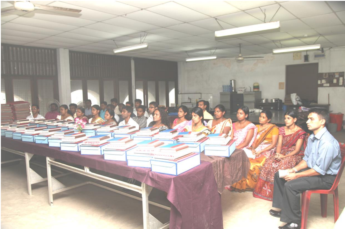
Course on Book Binding