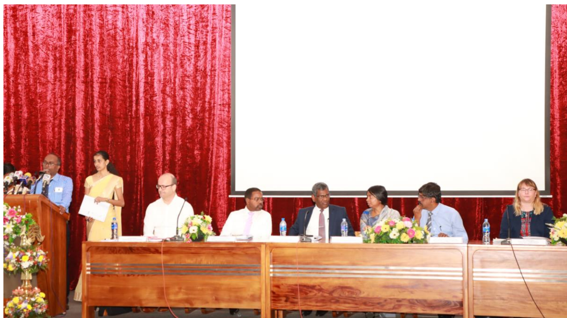
Inauguration ceremony of the Seminar on Managing Municipal Archives

The British established Municipal Councils during the nineteenth century under Ordinance No. 17 of 1865, aiming at an efficient local administration and service to the public. It was a landmark in the history of local government in Sri Lanka during the nineteenth century. Accordingly, Municipal Councils were first established in the major cities of Colombo, Kandy and Galle. Through this, urban community services such as constructions and maintenance of roads, street lighting, water supply, public health services, sanitary systems, and market facilities were provided. The records of these councils are deposited in the Department of National Archives.