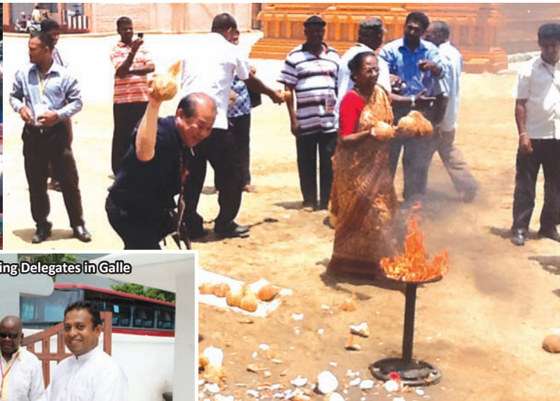
Deputy Speaker receiving Delegates in Galle