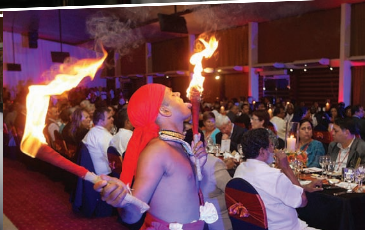
Dinner hosted by His Excellency Mahinda Rajapaksa Executive Committee Members and S