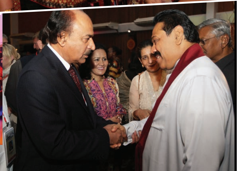
, the President of Sri Lanka for Leaders of Delegations, Spouses, at Temple Trees on 12.09.2012