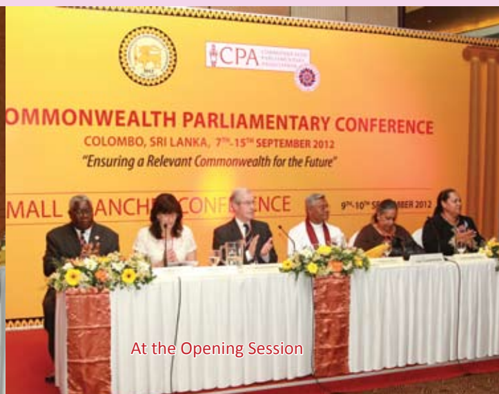
At the Opening Session