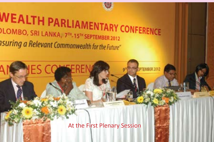
At the First Plenary Session