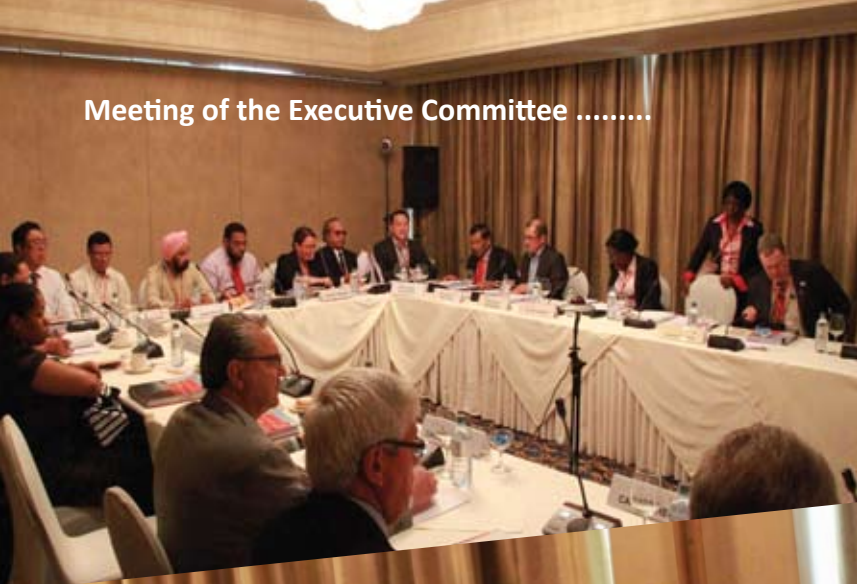
Meeting of the Executive Committee .....