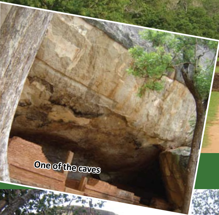
One of the caves