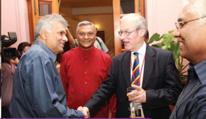
Dinner hosted by the Hon. Speaker for the members of the Executive Committee