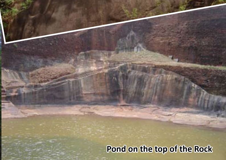
Pond on the top of the Rock