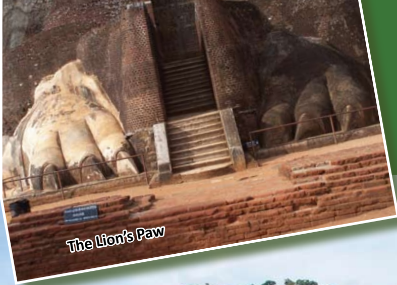
The Lion's Paw