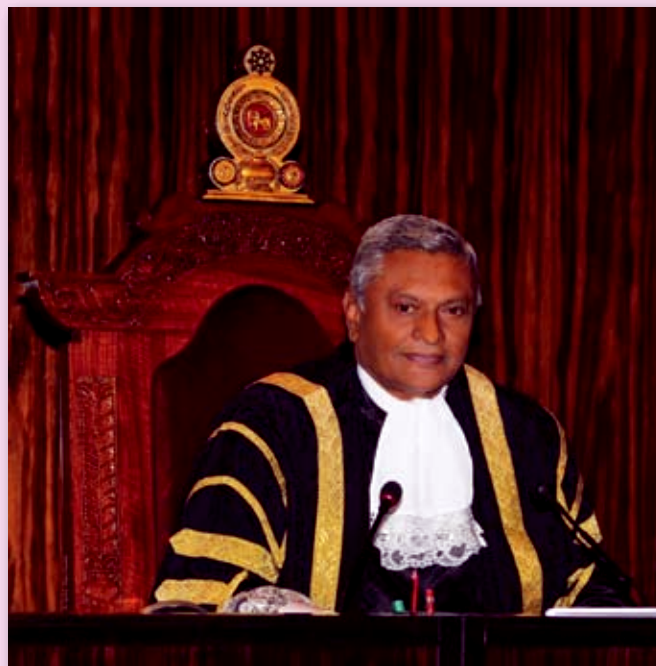
Chamal Rajapaksa, MP Speaker of Parliament of Sri Lanka and President of the Commonwealth Parliamentary Association

Ours is a beautiful country and I hope that amidst your deliberations, you will be able to get a glimpse of its natural beauty, its past and its culture. I sincerely hope that your stay with us in Sri Lanka would be a pleasant and an enjoyable experience.