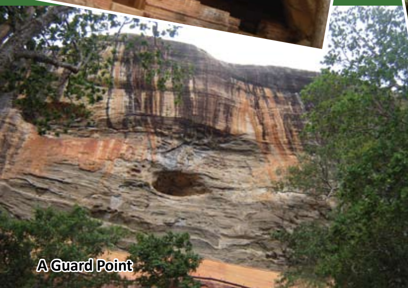
A Guard Point