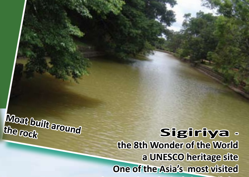
Moat built around the rock

Sigiriya - the 8th Wonder of the World a UNESCO heritage site One of the Asia's most visited large archaeological site. Built by King Kashyapa during the fifth century A.D., Sigiriya consists of a well designed palace complex on top of the rock, moats and ramparts, pleasure gardens around the rock. Also, famous for paintings on the western side of the rock.