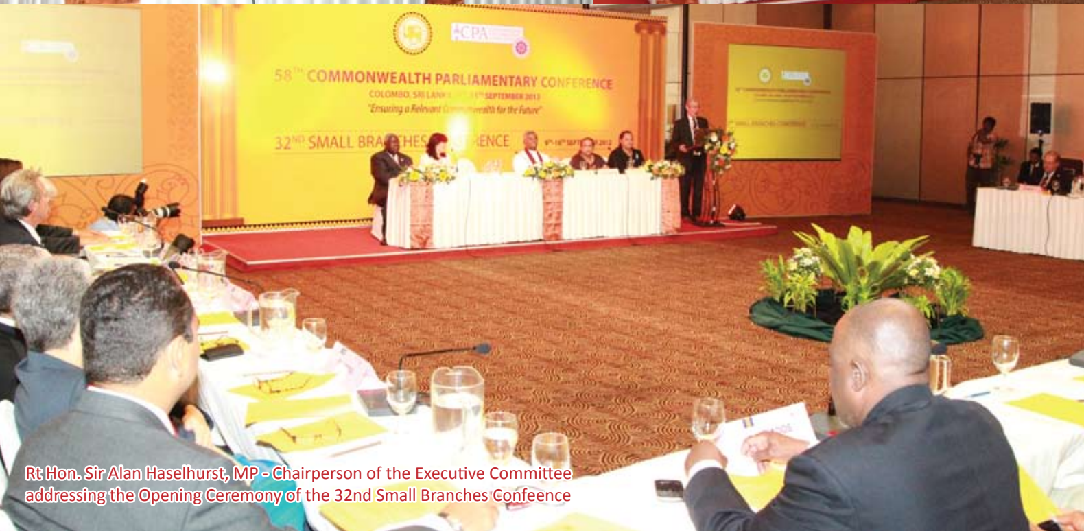
Rt Hon. Sir Alan Haselhurst, MP - Chairperson of the Executive Committee addressing the Opening Ceremony of the 32nd Small Branches Conference