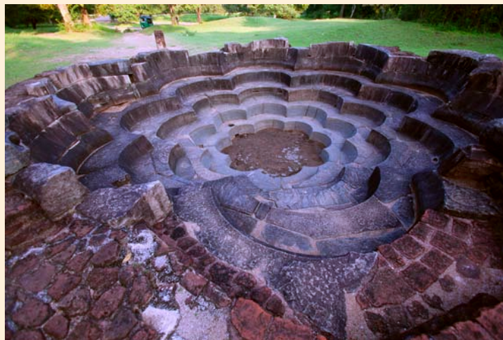
The Lotus Pond at Polonnaruwa

The ceiling of the verandah is painted with a colour-