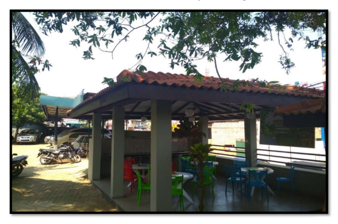
Divisional Secretariat Building – Beruwala , After Completion of the Construction