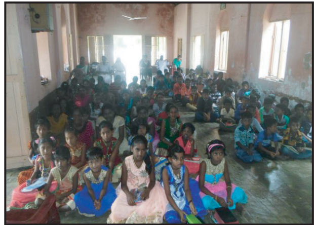
Daham Education programmes in Mannar by Development Officers