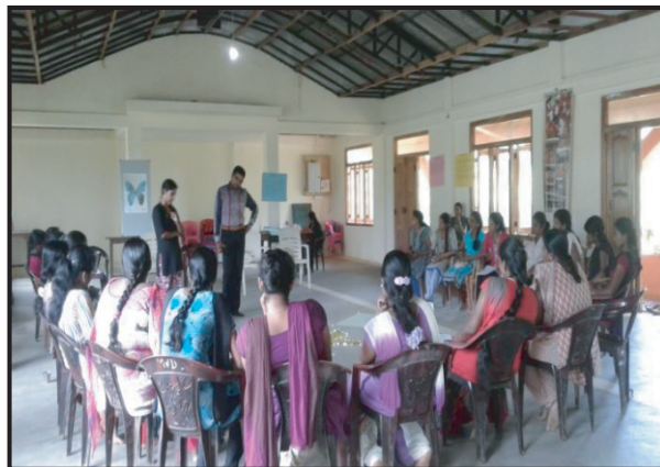
Programme for spiritual personality, Jaffna Diocese