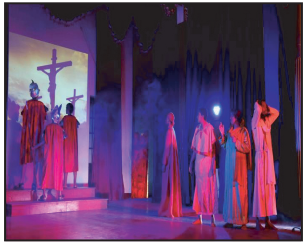
Lenten Drama, Kandy Diocese