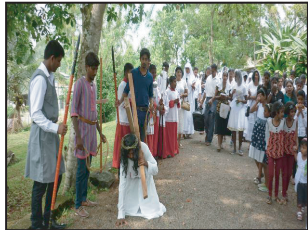
Lenten Drama, Galle Diocese