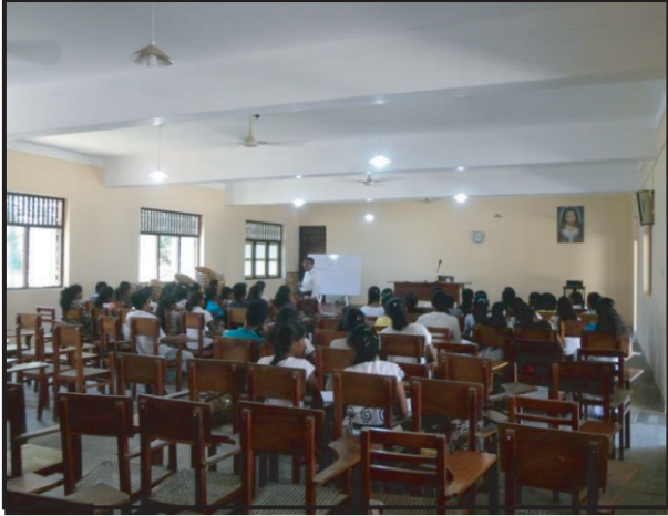
Training programmes for new Sunday school Teachers,