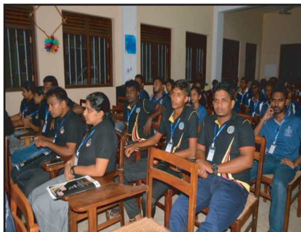
Youths programme, Galle Diocese