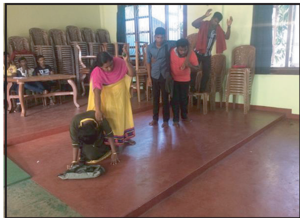
Workshops on Short Drama in Tamil medium