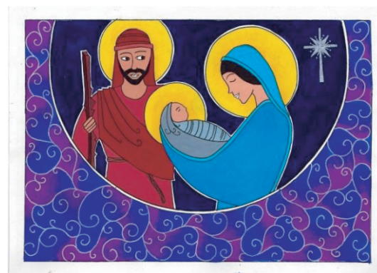
Painting selected for the invitation of the ceremony for launching Christmas Stamp

Ceremony for launching Christmas stamp -2017 was held in a grand manner at St'. Anthony's Cathedral, Kandy in the morning of 26 th November with the participation of religious and state leaders.