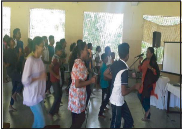
Workshops on Short Drama in Sinhala medium