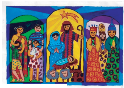
Paintings selected for Christmas Stamp