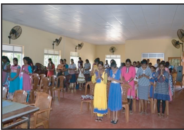
Programme for spiritual personality, Batticaloa Diocese