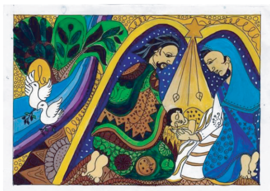
Painting selected for the Christmas greeting card