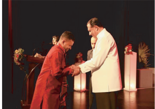
Awarding ceremony of Short Drama Competition on Holy Bible