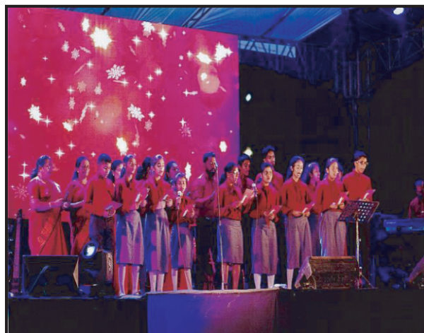
Christmas programme of Church of Ceylon