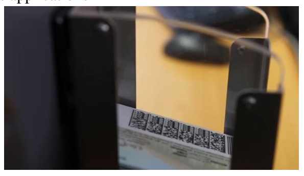
Identity cards in printing.