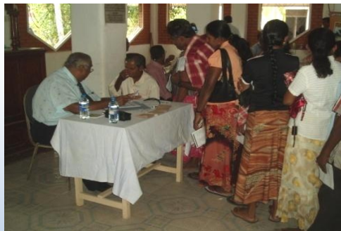
Conduct of medical and eye clinics to employees at Sumanarama Viharaya, Delthara for enhancement of employees.