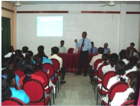
The awareness program conducted for employees concurrently Dayata Kirula, Anuradhapura.